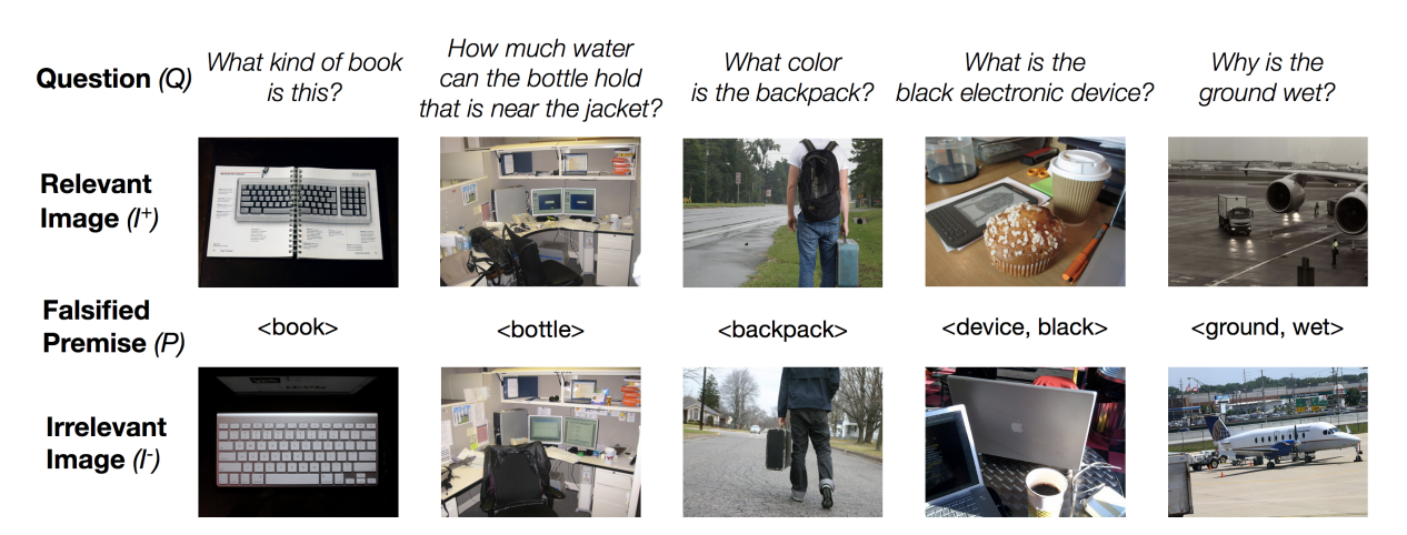
Figure 3: Some Examples from QRPE Dataset. For a given question Q and a relevant image I^+ , we find an irrelevant image I^- for which exactly one premise P of the question is false. If there are multiple such candidates, we select the candidate most visually most similar to I^+ . As can be seen from these examples, the QRPE dataset is very challenging, with only minor visual and semantic differences separating the relevant and irrelevant images.