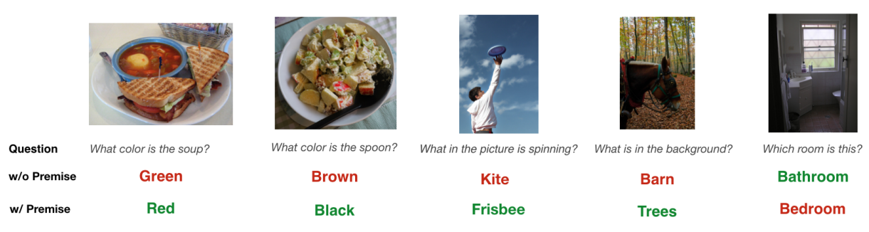
Figure 8: Some interesting examples of how augmentation helps the DeeperLSTM model (Antol et al., 2015) on the compositional VQA split.

Figure 7: Sample generated premise questions from source questions. Source questions are in bold. Ground-truth answers are extracted using the premise tuples.